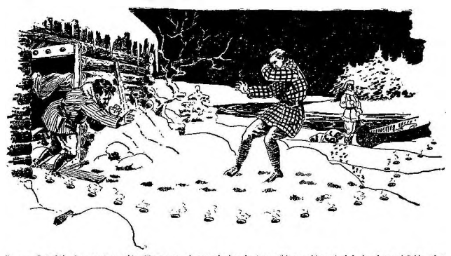
". . . Out of the door crept something like a man. A queer, broken, bent-over thing: a thing crippled, shrunken and flabby, that whined. This thing—yes, it was still Marr—crunched down at one side, quivering, whimpering. It moved its hands as a crushed ant moves its antennae; pirally without significance. . "